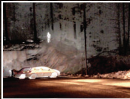
Color TV fused/blended with IR