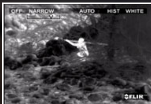
FLIR thermal imaging