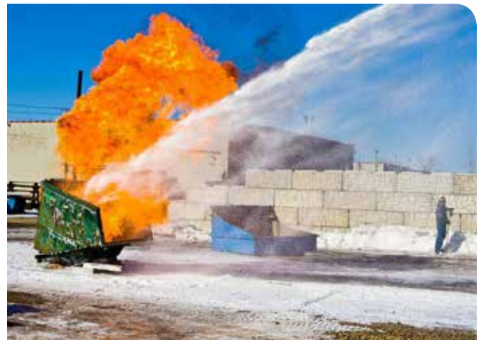
During a controlled demonstration of the Fire Rover's firefighting capabilities, the Watchdog Security team set fire to jet fuel in open metal bins. The FLIR A310f thermal camera instantly detected each fire, triggering a visual alarm (marked in red above). An operator using a laptop then aimed and released the Fire Rover's fire-fighting foam, extinguishing the fires in seconds.

the A310f ignores visible light, it works equally well day or night.