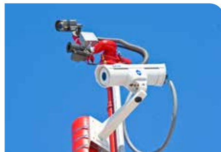
The FLIR A310f is the essential component of the Fire Rover system.