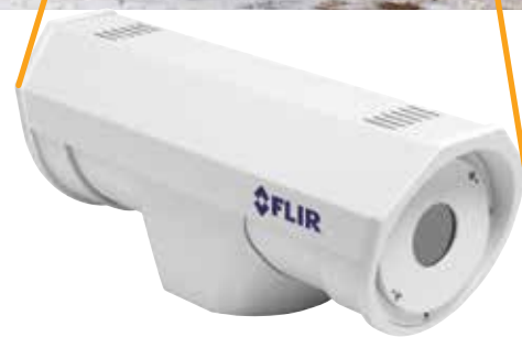
FLIR A310f thermal imaging camera.

The A310f has extensive alarm functions and can automatically send analysis results, IR images and additional data as an e-mail using Modbus TCP/IP or Ethernet IP. The A310f has a fixed 25° lens and outputs both PAL and NTSC composite video. And because